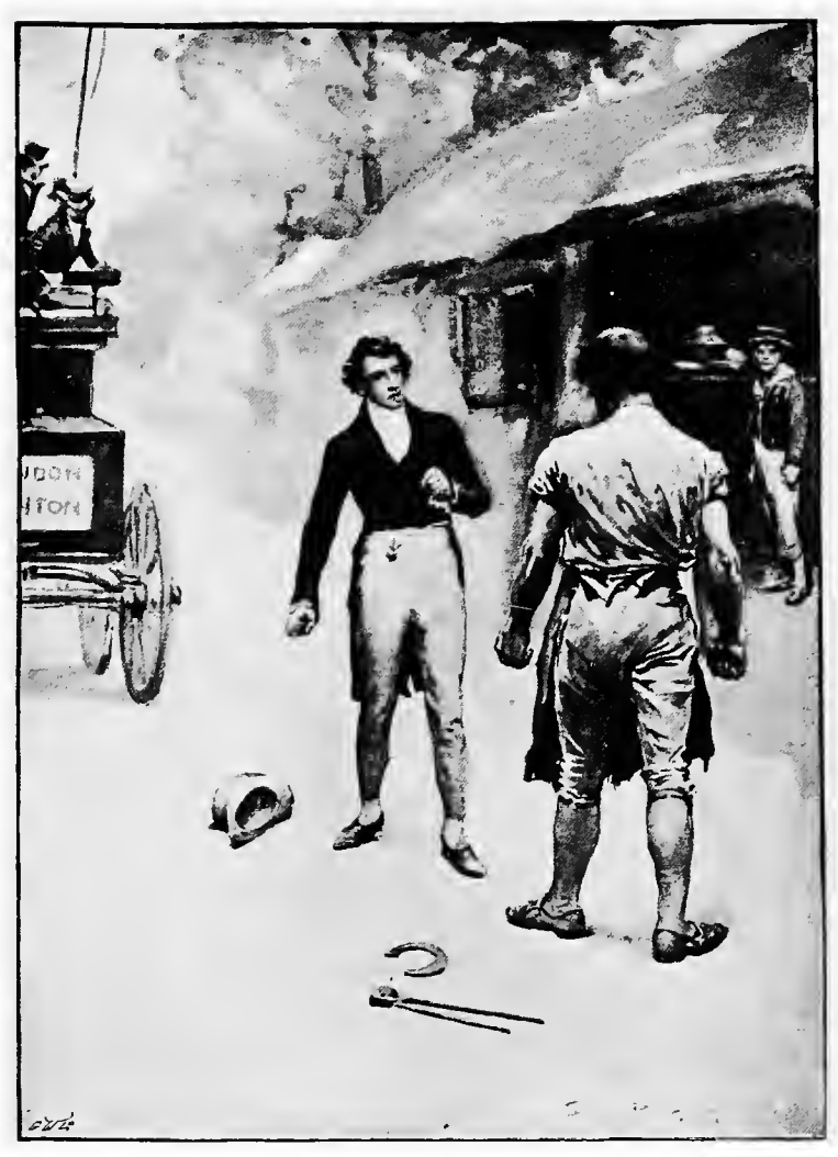
1 SAW HIM LOOK HARD AT HIS ANTAGONIST.